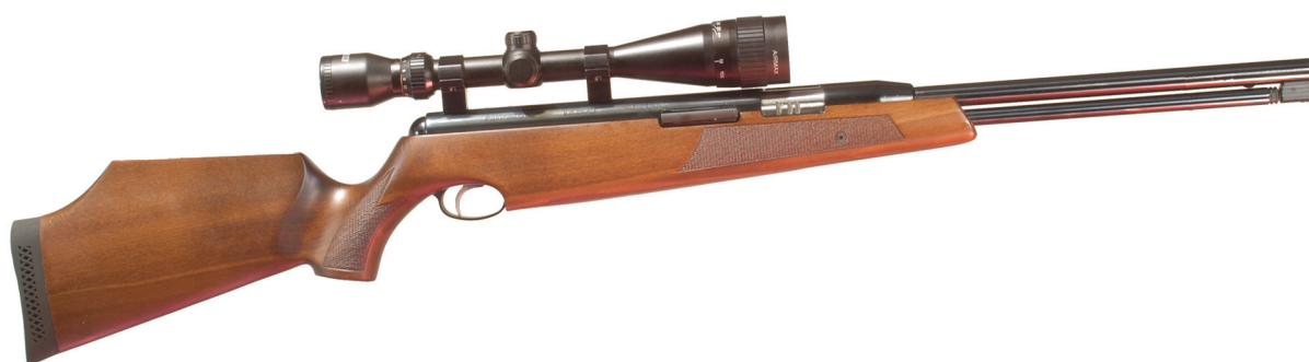
Shown with optional telescopic sight

PLEASE READ THIS MANUAL BEFORE USING YOUR NEW RIFLE, IT CONTAINS IMPORTANT SAFETY INFORMATION AND INSTRUCTION ON ADJUSTMENT AND MAINTENANCE.